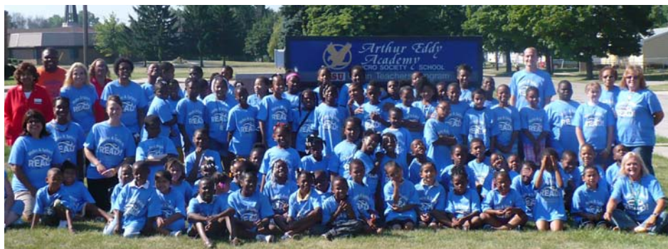
Summer Reading Program finishers from Arthur Eddy Academy, one of our many outreach participating program sites.