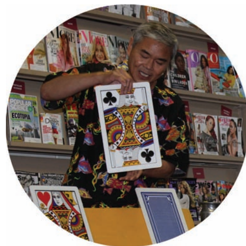
Ming the Magnificent entertains children at Claytor Library.