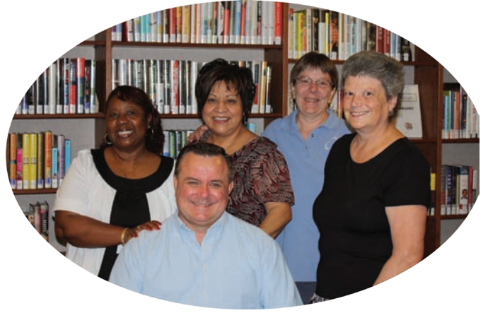
Hoyt Library retirees.

Two hundred and thirty-five years of service walked out the doors of the Public Libraries of Saginaw over the summer. Eight long-time employees from the Hoyt and Butman-Fish branches retired. The wealth of talent and experience the employees gave to the library system is immeasurable and they will be deeply missed. Each individual contributed something unique to the library system.