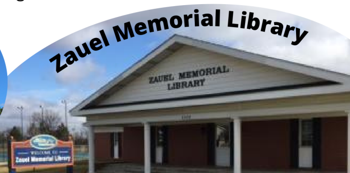
Zaue Memorial Library